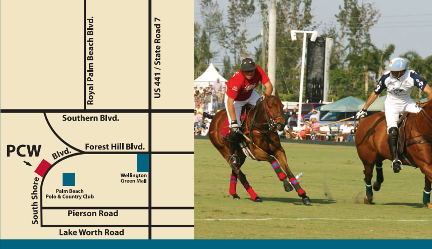
Prime Location on South Shore Boulevard

Global Commercial Investment Realty, LLC www.ProfessionalCenteratWellington.com